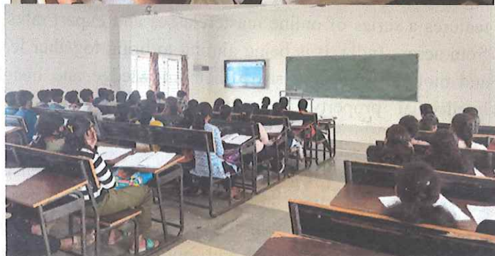
Glimpses of the Lecture session