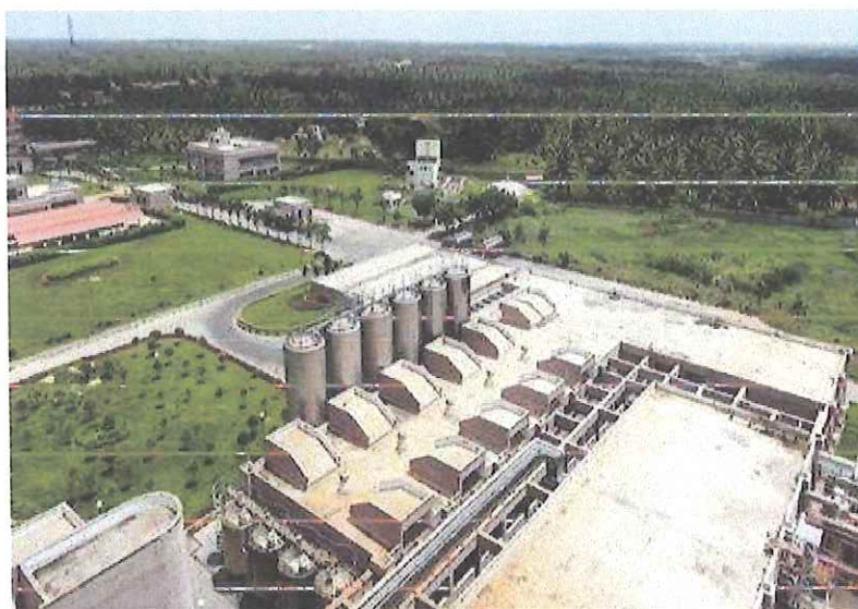
Fig 01. Infrastructure of KMF.