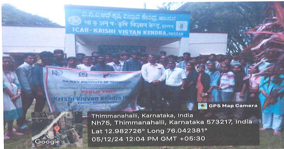
Picture during Field visit to KVK Hassan