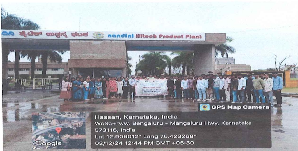
Picture during Field visit to Nandini Plant, Channarayapatna